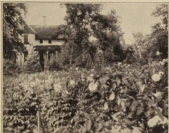
Home of Springhill Dahlia Farm and Section of Dahlia Show Garden